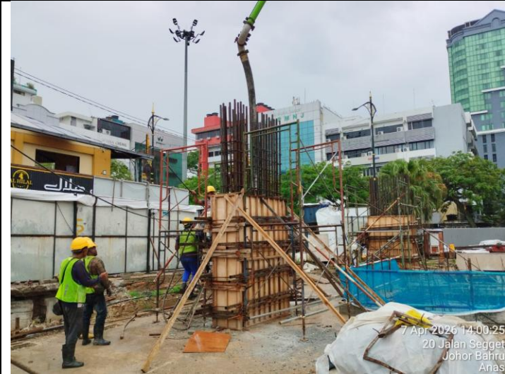
secondary casting of columns in progress