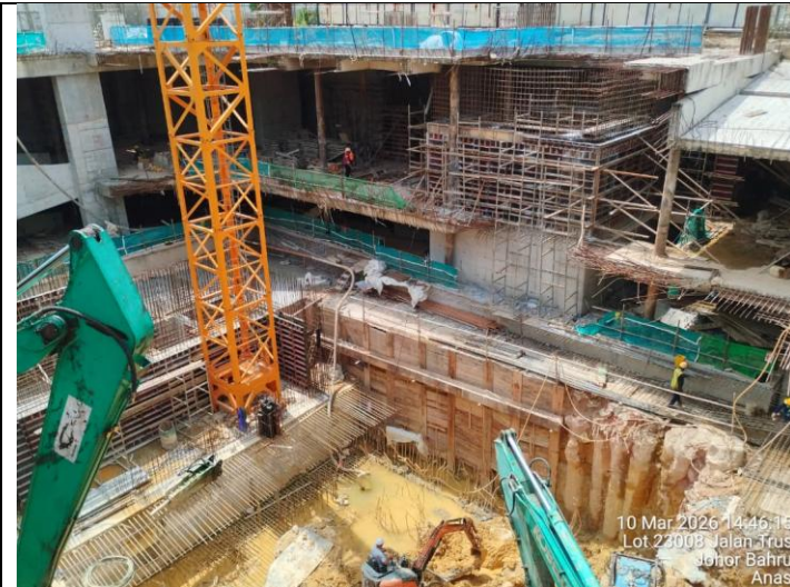
10 Mar 2026 14:46:16 Lot 23008 Jalan Trus Johor Bahru Anas