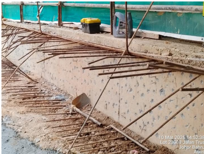
10 Mar 2026 14:52:38 Lot 23008 Jalan Trus Johor Bahru Anas