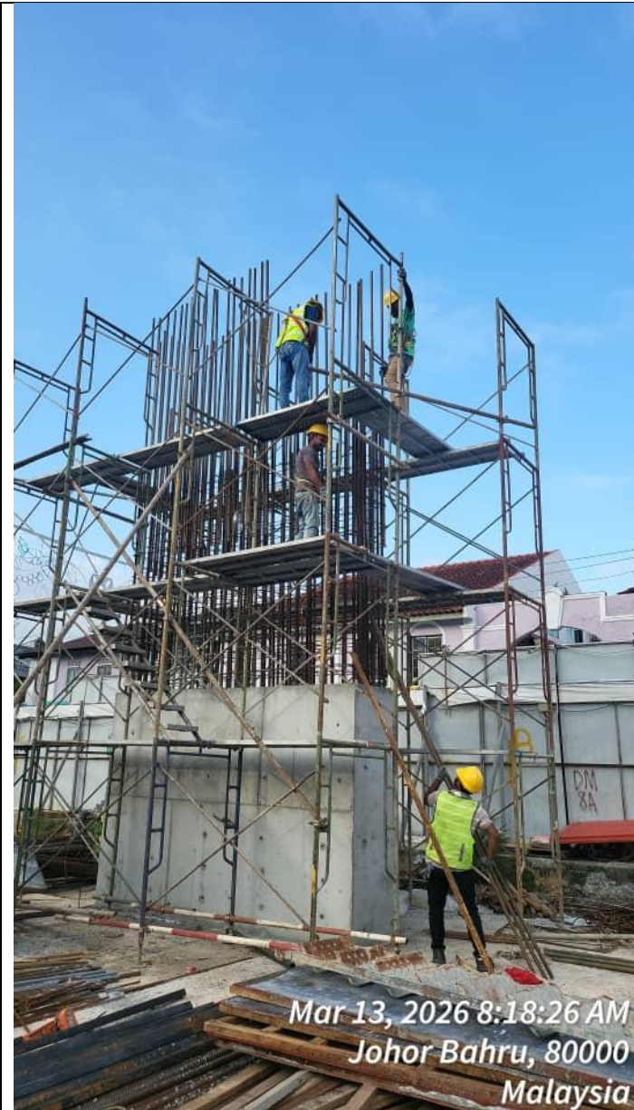
Barbending works for 2nd casting