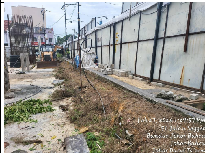
Feb 27, 2026 1:29:57 PM 51 Jalan Segget Bandar Johor Bahru Johor Bahru Johor Darul Ta'zim

Drainage works commenced and demolition and hacking works of existing perimeter drain ongoing